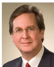
Mayor Dewey Bartlett